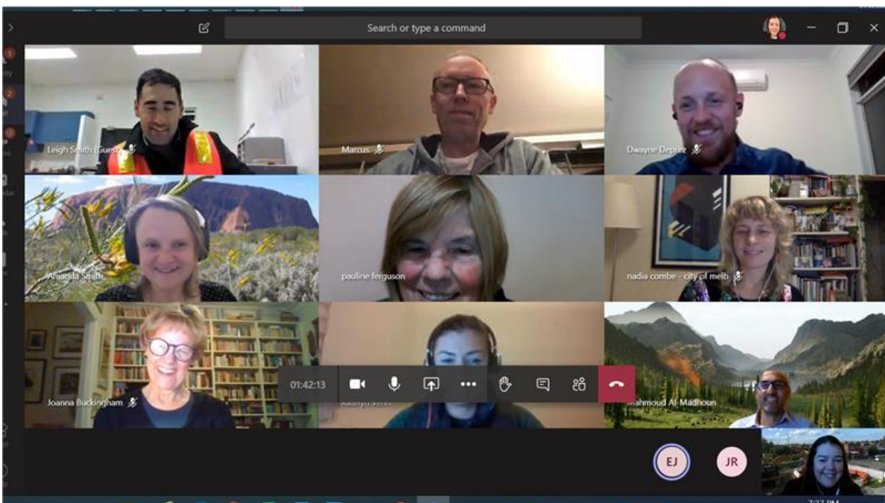
Image1: CRG online meeting (using Zoom)