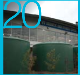
Victoria University pools water saving