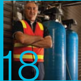
Amcor's water saving solution