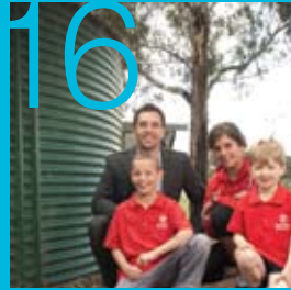
VicTrack puts excess water to good use