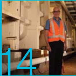
Brewing water efficiency at CUB