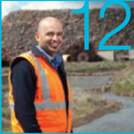
Water use crushed at Alex Fraser Group