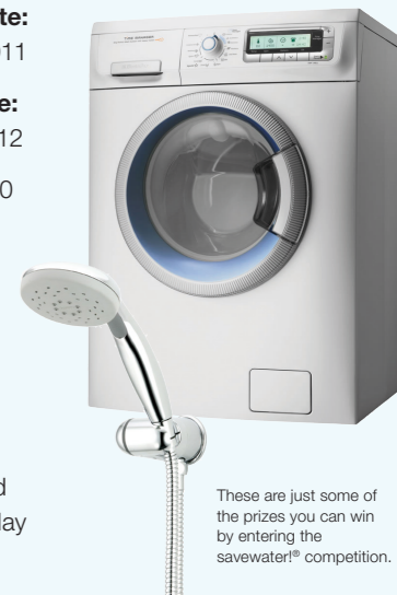
These are just some of the prizes you can win by entering the savewater!® competition.

All winners will be emailed directly and published on www.savewater.com.au . Winners of prizes greater than $100 will be published in The Australian on Saturday 21 April 2012.