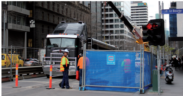
Stage one of the renewal works between Bourke and Lonsdale Streets, Melbourne.

For more information, visit www.citywestwater.com.au , email williamstreetworks@citywestwater.com.au or call the City West Water Customer Contact Centre on 131 691.