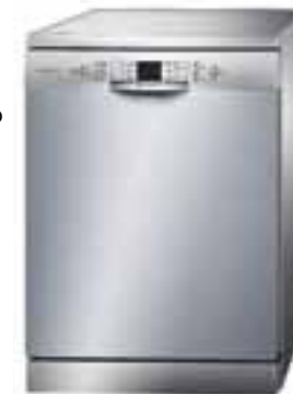
You could win this Bosch Australian dishwasher.

All winners will be emailed directly and published on www.savewater.com.au . Winners of prizes greater than $100 will be published in The Australian on Saturday 15 October 2011.