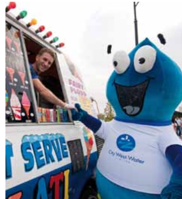
City West Water mascot, Wilbur the Waterdrop, enjoyed an ice-cream while at Lakeside Live.

City West Water staff were there, along with Wilbur the Waterdrop, providing educational information. To find out when City West Water will be at a community event near you, visit www.citywestwater.com.au .